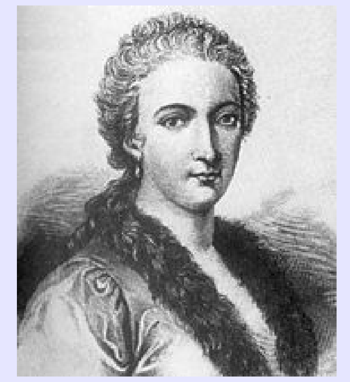
Maria Gaetana Agnesi First woman mathematics professor