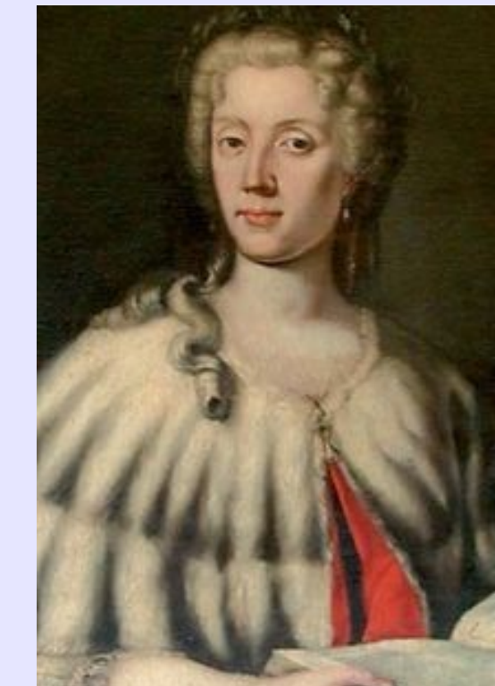
Laura Maria Catarina Bassi World's first female professor