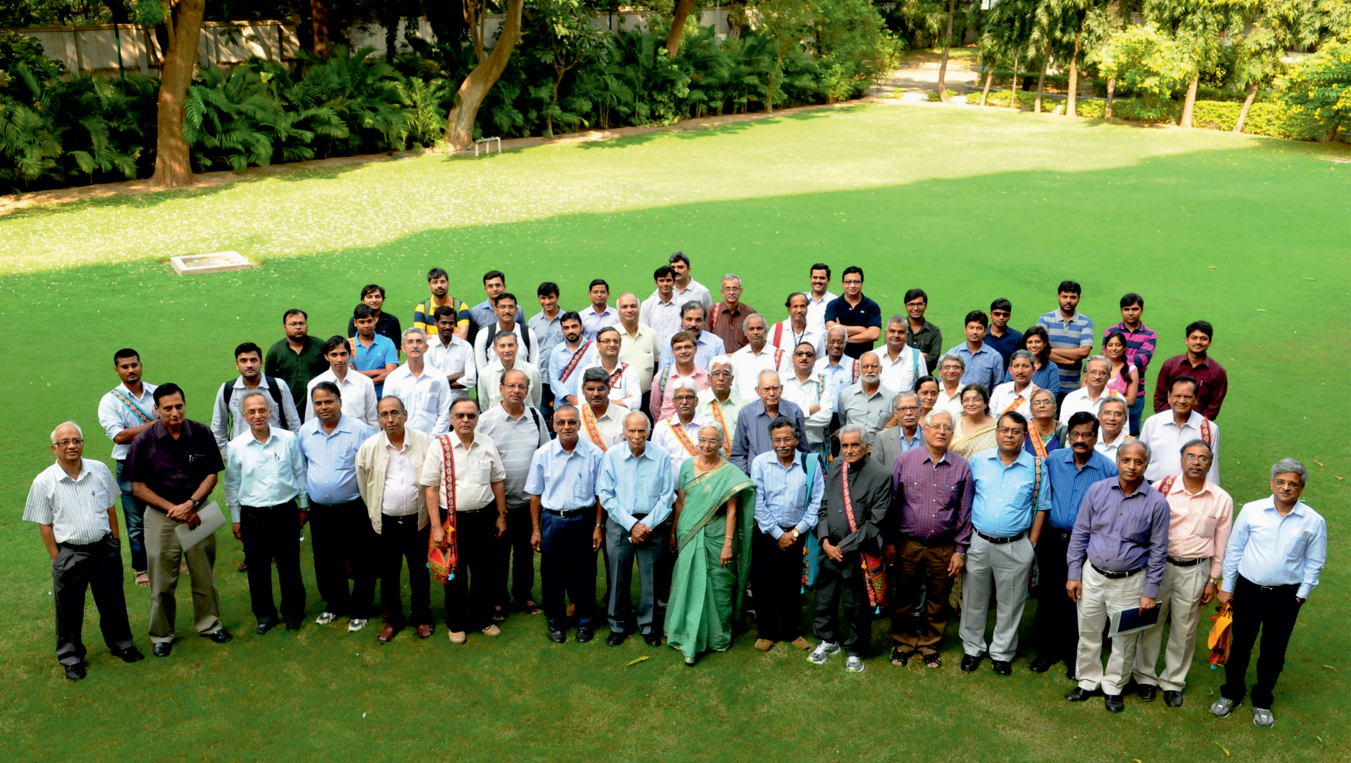
PRL Alumni Association One day Meeting 10 November, 2014 at PRL, Ahmedabad